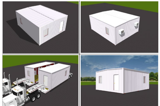
FastFlex Pre-Engineered Buildings shown in 22' x 27'