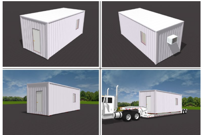
FastFlex Pre-Engineered Buildings shown in 11' x 27' specifically designed to fit on a flatbed semi-trailer.

All FastFlex products are designed, detailed and fabricated in the United States by thousands of proud U.S. teammates from 100% U.S. made steel.